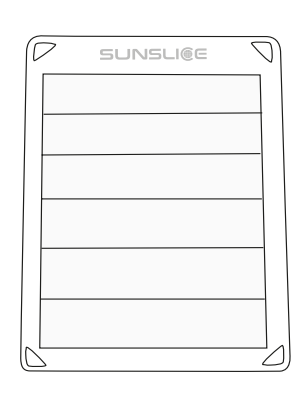
Fusion Flex 6